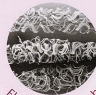
Spanfit® - Carefree