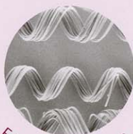
Spanfit® - Elegant